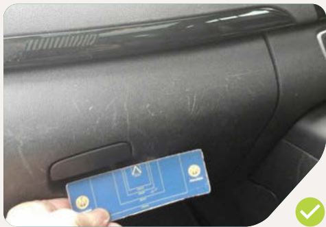
Scratches that reflect normal use are acceptable.