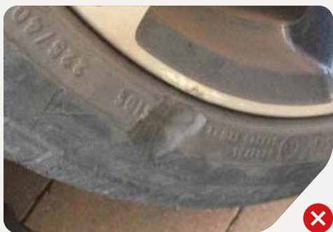
Tyre sidewall damage is not acceptable.