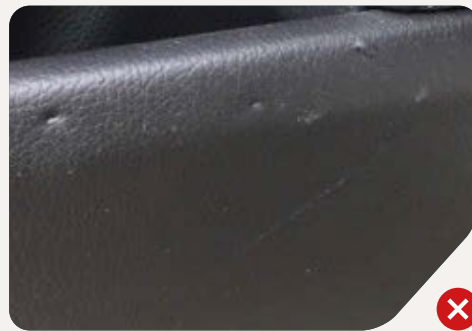
Holes to the interior upholstery and trim and not acceptable.