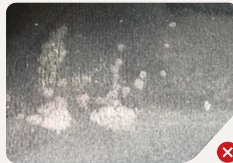
The interior of the vehicle must be clean and odourless with no burns, scratches, tears, dents or staining.